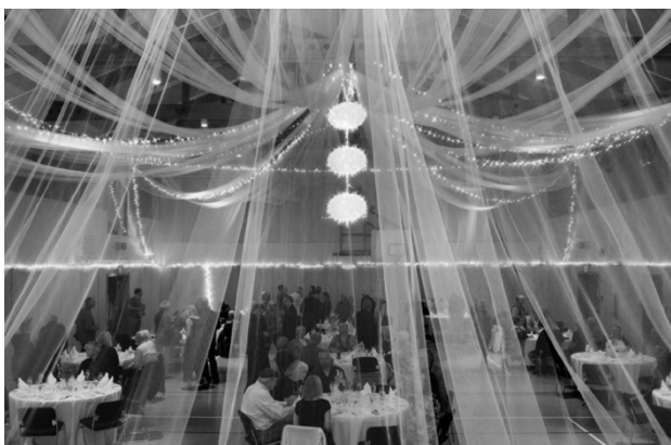
The main gym can accommodate 300 guests

For rental availability and rates please contact: Melanie Gaines 250.539.2452 or mgaines0@icloud.com