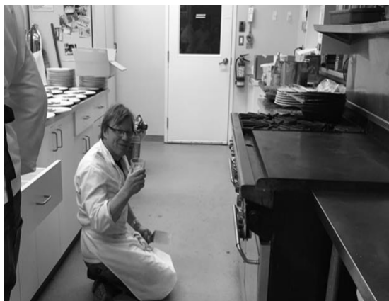
A well-equipped professional kitchen is available for special events